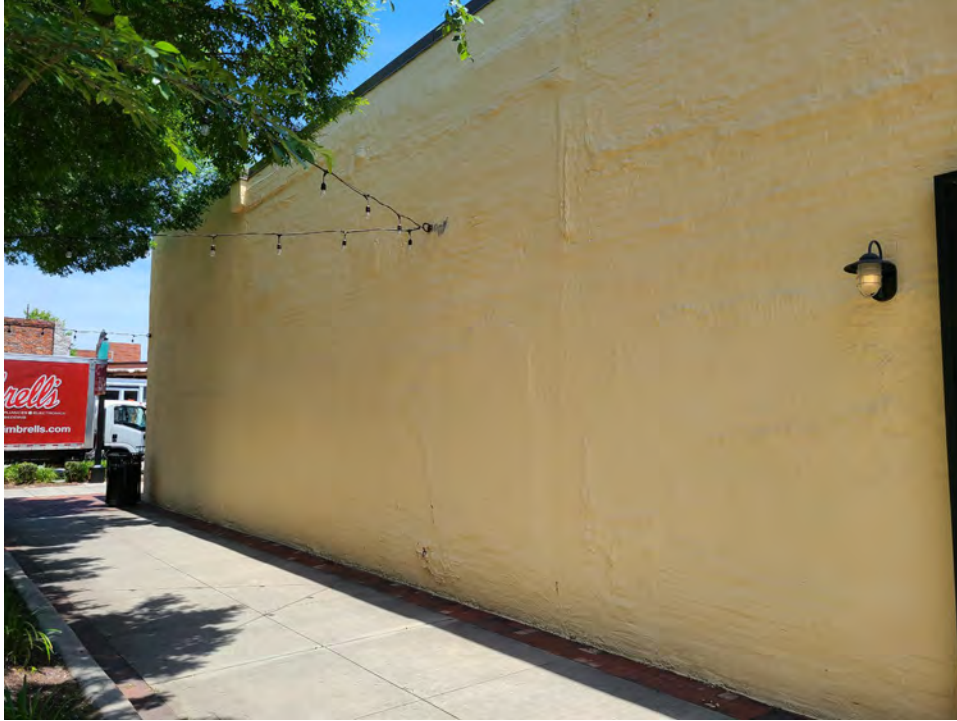
Above: West Façade of building (Facing alley)