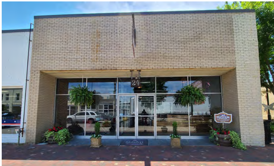
Above: Front (North) Façade of building (Facing W. Liberty St.)