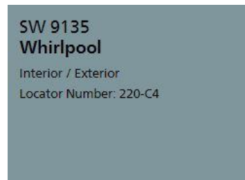
Proposed Siding Color No Change

The revised exterior material color blocks are shown below: